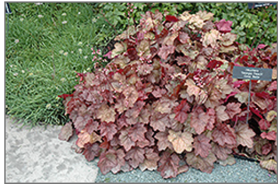
Georgia Peach Coral Bells

Georgia Peach Coral Bells is recommended for the following landscape applications;