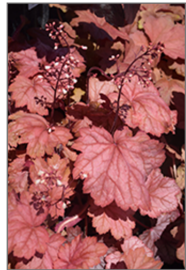
Georgia Peach Coral Bells in bloom