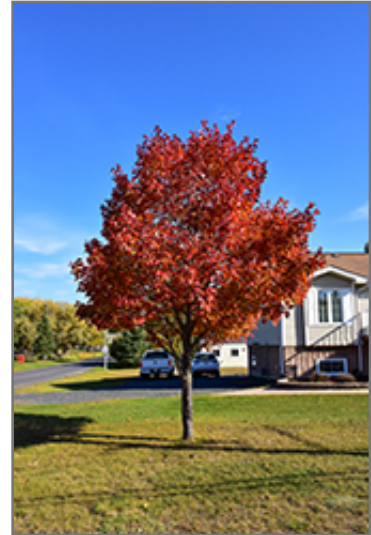
Northwood Red Maple in fall