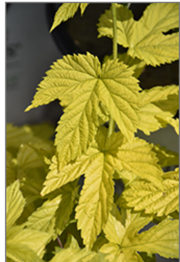
Golden Hops foliage