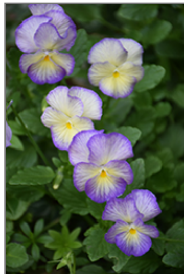
Etain Pansy flowers