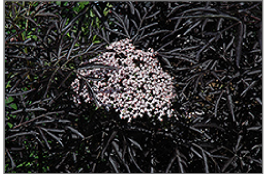
Black Lace Elder flowers