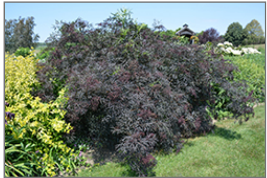
Black Lace Elder