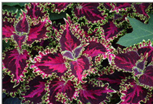
Volcanica Solar Flare Coleus foliage

Volcanica Solar Flare Coleus is recommended for the following landscape applications;