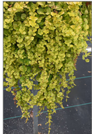
Goldii Creeping Jenny foliage