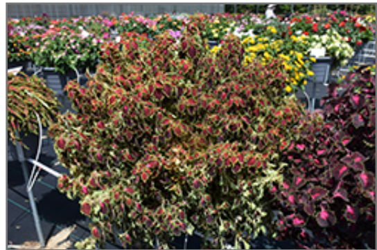
TrailBlazer Glory Road Coleus