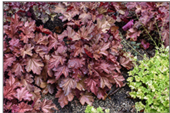
Magma Coral Bells