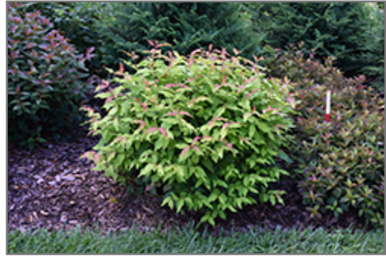
Kodiak Fresh Diervilla

* This is a 'special order' plant - contact store for details