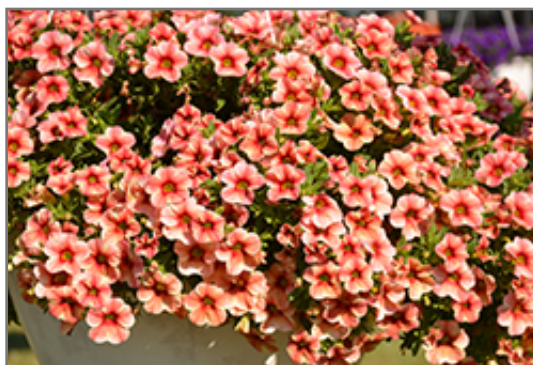
Volcano Sunset Calibrachoa flowers