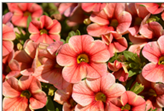
Volcano Sunset Calibrachoa flowers

Volcano Sunset Calibrachoa is recommended for the following landscape applications;