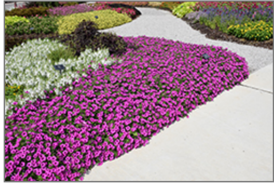
Supertunia Vista Jazzberry Petunia in bloom

Supertunia Vista Jazzberry Petunia is a fine choice for the garden, but it is also a good selection for planting in outdoor containers and hanging baskets. Because of its trailing habit of growth, it is ideally suited for use as a 'spiller' in the 'spiller-thriller-filler' container combination; plant it near the edges where it can spill gracefully over the pot. It is even sizeable enough that it can be grown alone in a suitable container. Note that when growing plants in outdoor containers and baskets, they may require more frequent waterings than they would in the yard or garden.