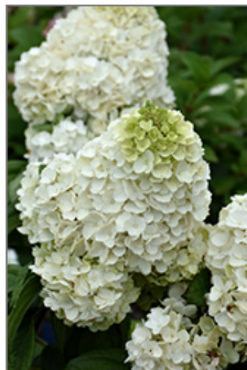
Moonrock Hydrangea flowers