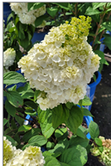
Moonrock Hydrangea flowers