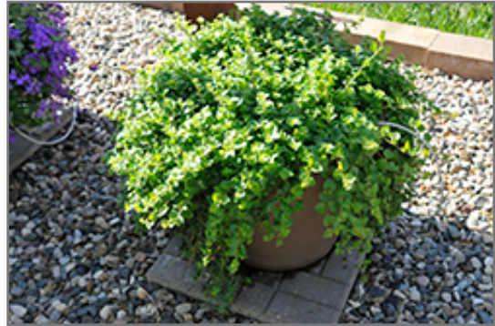
Indian Mint