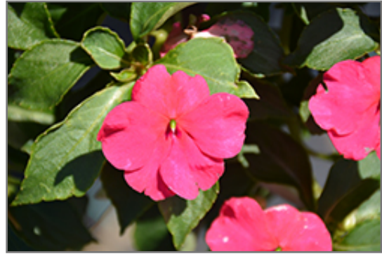
Beacon Rose Impatiens flowers

Beacon Rose Impatiens will grow to be about 15 inches tall at maturity, with a spread of 12 inches. When grown in masses or used as a bedding plant, individual plants should be spaced approximately 8 inches apart. Its foliage tends to remain dense right to the ground, not requiring facer plants in front. This fast-growing annual will normally live for one full growing season, needing replacement the following year.