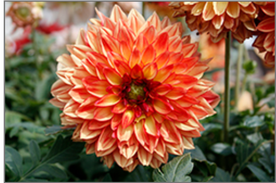
Venti Tequila Sunrise Dahlia flowers

Venti Tequila Sunrise Dahlia is recommended for the following landscape applications;