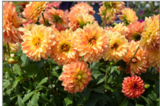
Venti Tequila Sunrise Dahlia flowers