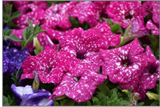
Headliner Pink Sky Petunia flowers

Headliner Pink Sky Petunia is recommended for the following landscape applications;