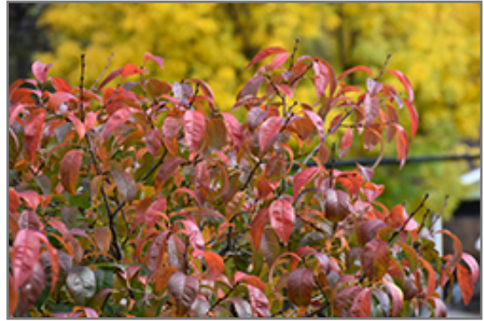
Muckle Plum in fall

This shrub should only be grown in full sunlight. It does best in average to evenly moist conditions, but will not tolerate standing water. It is not particular as to soil type or pH. It is highly tolerant of urban pollution and will even thrive in inner city environments. This particular variety is an interspecific hybrid.