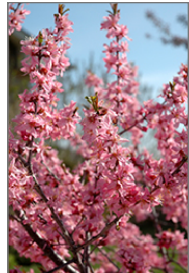
Muckle Plum flowers