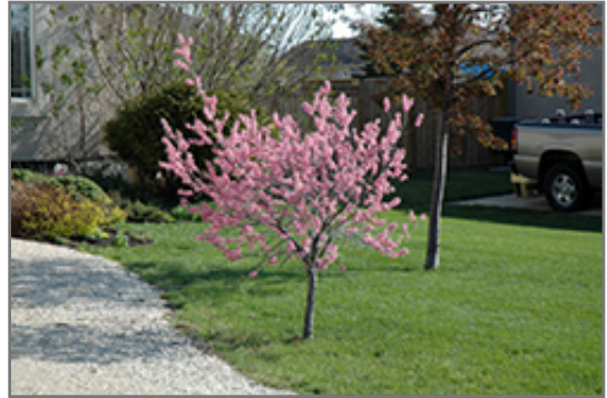
Muckle Plum in bloom

* This is a 'special order' plant - contact store for details