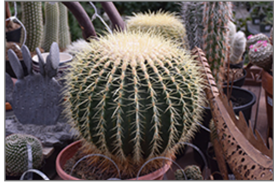
Golden Barrel Cactus in full

Golden Barrel Cactus is a succulent evergreen plant. It is a member of the cactus family, which are grown primarily for their characteristic shapes, their interesting features and textures, and their high tolerance for hot, dry growing environments. Like all cacti, it doesn't actually have leaves, but rather modified succulent stems that comprise the bulk of the plant, and which are designed to hold water for long periods of time. This particular cactus is valued for its distinctive barrel shape, and usually grows as a single spiny ribbed green stem. This plant has yellow cup-shaped flowers held atop the stems from late spring to early summer, which are interesting on close inspection.