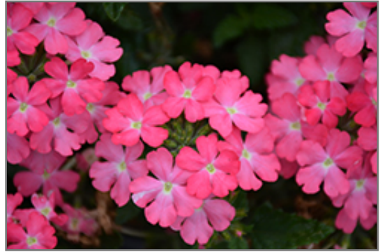
Firehouse Pink Verbena flowers

Firehouse Pink Verbena is recommended for the following landscape applications;