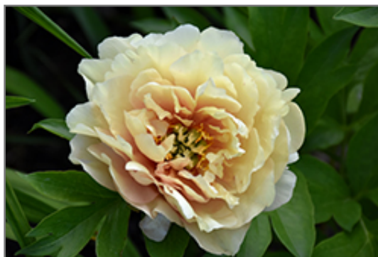
Canary Brilliants Peony flowers