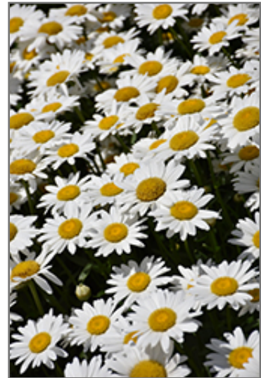
Becky Shasta Daisy flowers