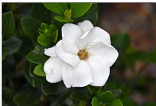
Gardenia flowers

When grown indoors, Gardenia can be expected to grow to be about 8 feet tall at maturity, with a spread of 6 feet. It grows at a slow rate, and under ideal conditions can be expected to live for approximately 30 years. This houseplant will do well in a location that gets either direct or indirect sunlight, although it will usually require a more brightly-lit environment than what artificial indoor lighting alone can provide. It does best in average to evenly moist soil, but will not tolerate standing water. The surface of the soil shouldn't be allowed to dry out completely, and so you should expect to water this plant once and possibly even twice each week. Be aware that your particular watering schedule may vary depending on its location in the room, the pot size, plant size and other conditions; if in doubt, ask one of our experts in the store for advice. It is very fussy about its soil conditions and must be grown in rich, acidic soil to ensure success. Contact the store for specific recommendations on pre-mixed potting soil for this plant.