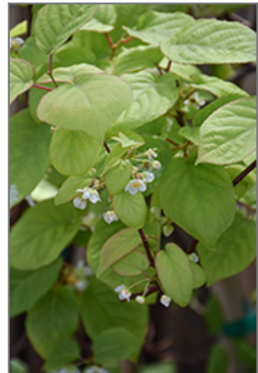
Variegated Hardy Kiwi Vine flowers