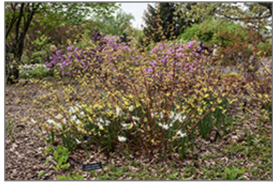
Neon Burst Dogwood in spring

Neon Burst Dogwood will grow to be about 5 feet tall at maturity, with a spread of 5 feet. It tends to fill out right to the ground and therefore doesn't necessarily require facer plants in front, and is suitable for planting under power lines. It grows at a fast rate, and under ideal conditions can be expected to live for approximately 20 years.