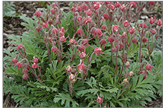
Prairie Smoke in bloom

This plant will require occasional maintenance and upkeep, and should be cut back in late fall in preparation for winter. It is a good choice for attracting butterflies to your yard, but is not particularly attractive to deer who tend to leave it alone in favor of tastier treats. Gardeners should be aware of the following characteristic(s) that may warrant special consideration;