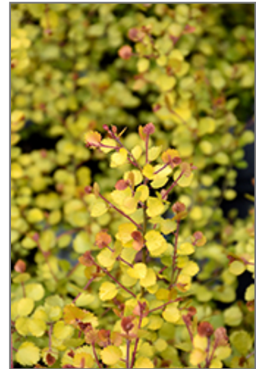
Cesky Gold Dwarf Birch foliage