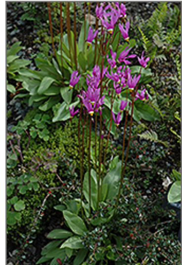
Shooting Star in bloom