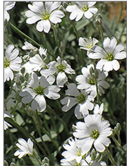
Snow-In-Summer flowers