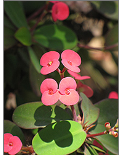
Crown Of Thorns flowers

This is a multi-stemmed evergreen houseplant with an upright spreading habit of growth. This plant may benefit from an occasional pruning to look its best.