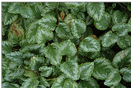
Jade Frost Archangel foliage