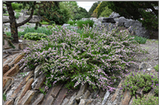
Purple Broom in bloom