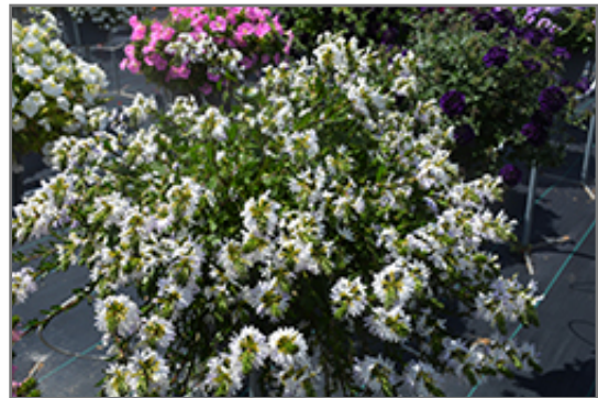
White Sparkle Fan Flower in bloom