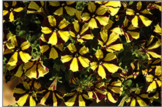
Sunflower Ray Petunia flowers

Sunflower Ray Petunia is recommended for the following landscape applications;