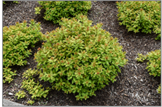
Dakota Goldcharm Spirea

This shrub should only be grown in full sunlight. It prefers to grow in average to moist conditions, and shouldn't be allowed to dry out. It is not particular as to soil type or pH. It is highly tolerant of urban pollution and will even thrive in inner city environments. This is a selected variety of a species not originally from North America.