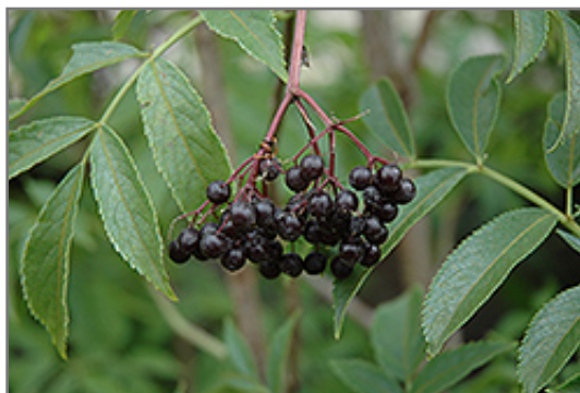
Adams American Elder fruit

Adams American Elder is recommended for the following landscape applications;