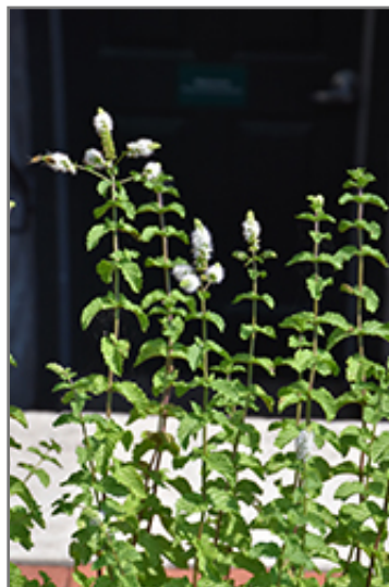
Spearmint flowers