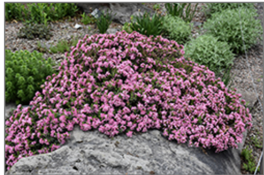
Rose Daphne in bloom