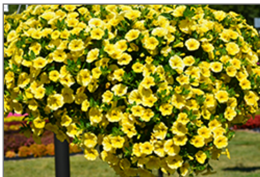
Aloha Canary Yellow Calibrachoa in bloom