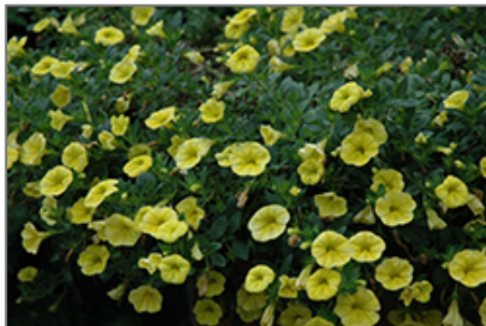
Aloha Canary Yellow Calibrachoa flowers

Aloha Canary Yellow Calibrachoa is recommended for the following landscape applications;