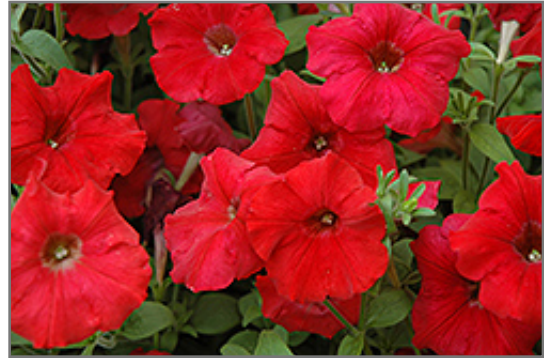
Easy Wave Red Petunia flowers

This plant will require occasional maintenance and upkeep. Trim off the flower heads after they fade and die to encourage more blooms late into the season. It is a good choice for attracting hummingbirds to your yard, but is not particularly attractive to deer who tend to leave it alone in favor of tastier treats. It has no significant negative characteristics.