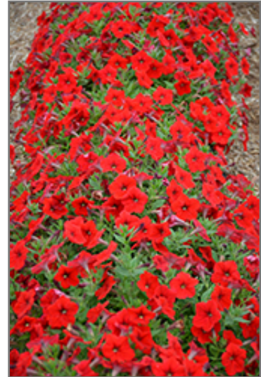
Easy Wave Red Petunia in bloom

Easy Wave Red Petunia is a fine choice for the garden, but it is also a good selection for planting in outdoor containers and hanging baskets. Because of its trailing habit of growth, it is ideally suited for use as a 'spiller' in the 'spiller-thriller-filler' container combination; plant it near the edges where it can spill gracefully over the pot. Note that when growing plants in outdoor containers and baskets, they may require more frequent waterings than they would in the yard or garden.