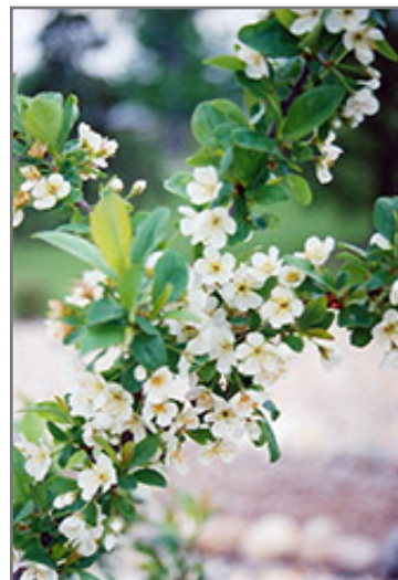
Opata Cherry-Plum flowers