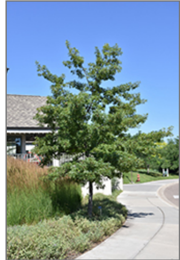
Majestic Skies Northern Pin Oak