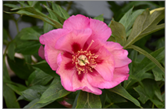
Takara Peony flowers