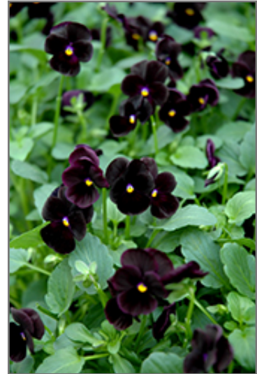
Sorbet Black Delight Pansy flowers