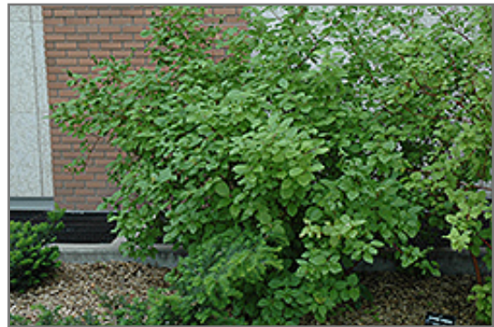
Siberian Dogwood