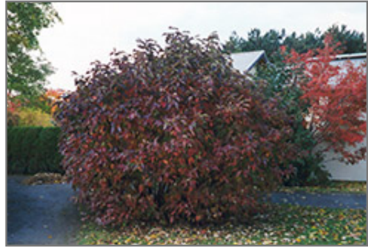
Siberian Dogwood in fall

This shrub does best in full sun to partial shade. It is an amazingly adaptable plant, tolerating both dry conditions and even some standing water. It is not particular as to soil type or pH. It is highly tolerant of urban pollution and will even thrive in inner city environments. This is a selected variety of a species not originally from North America.