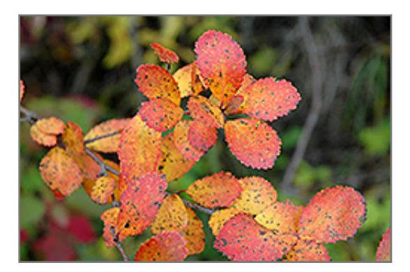
Arctic Birch in fall

* This is a 'special order' plant - contact store for details