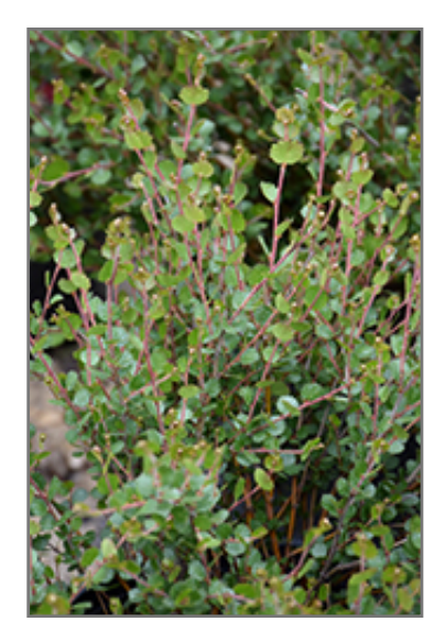
Arctic Birch foliage