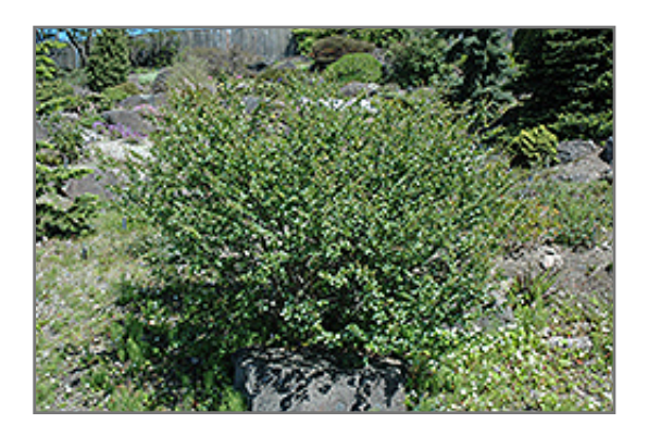
Arctic Birch