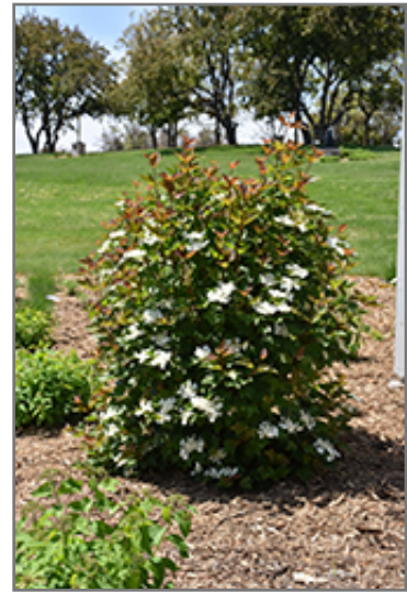
Redwing Highbush Cranberry in bloom