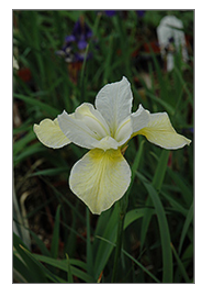
Butter And Sugar Siberian Iris flowers