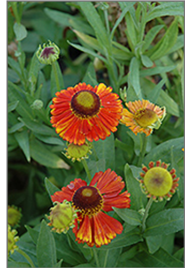
Sahin's Early Flowerer Sneezeweed flowers

This plant will require occasional maintenance and upkeep, and should be cut back in late fall in preparation for winter. It is a good choice for attracting butterflies to your yard, but is not particularly attractive to deer who tend to leave it alone in favor of tastier treats. Gardeners should be aware of the following characteristic(s) that may warrant special consideration;