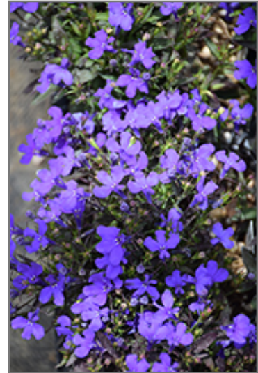
Crystal Palace Lobelia flowers

Crystal Palace Lobelia is recommended for the following landscape applications;